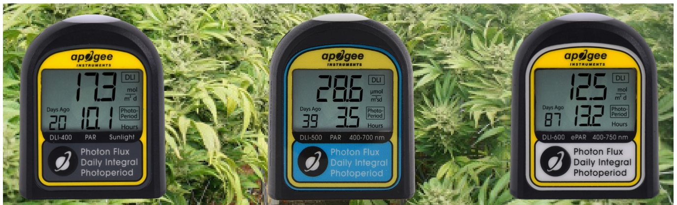
DLI-400: Sunlight Only PAR 400-700 nm

Apogee's new Daily Light Integral and Photoperiod meters are an elegant and accurate solution for measuring Daily Light Integral (DLI) and Photoperiod for up to 99 days.